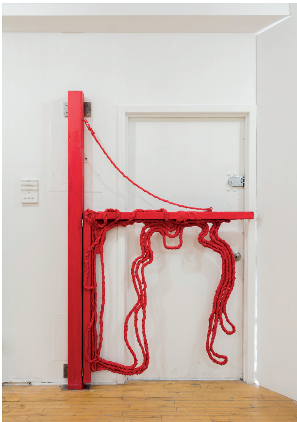
ABOVE City Lights ( Dead Horse Bay ), 2016, bronze and painted wood, 105 × 125 × 65 cm. Courtesy: the artist and Bortolami, New York; photograph: © Stefan Stark