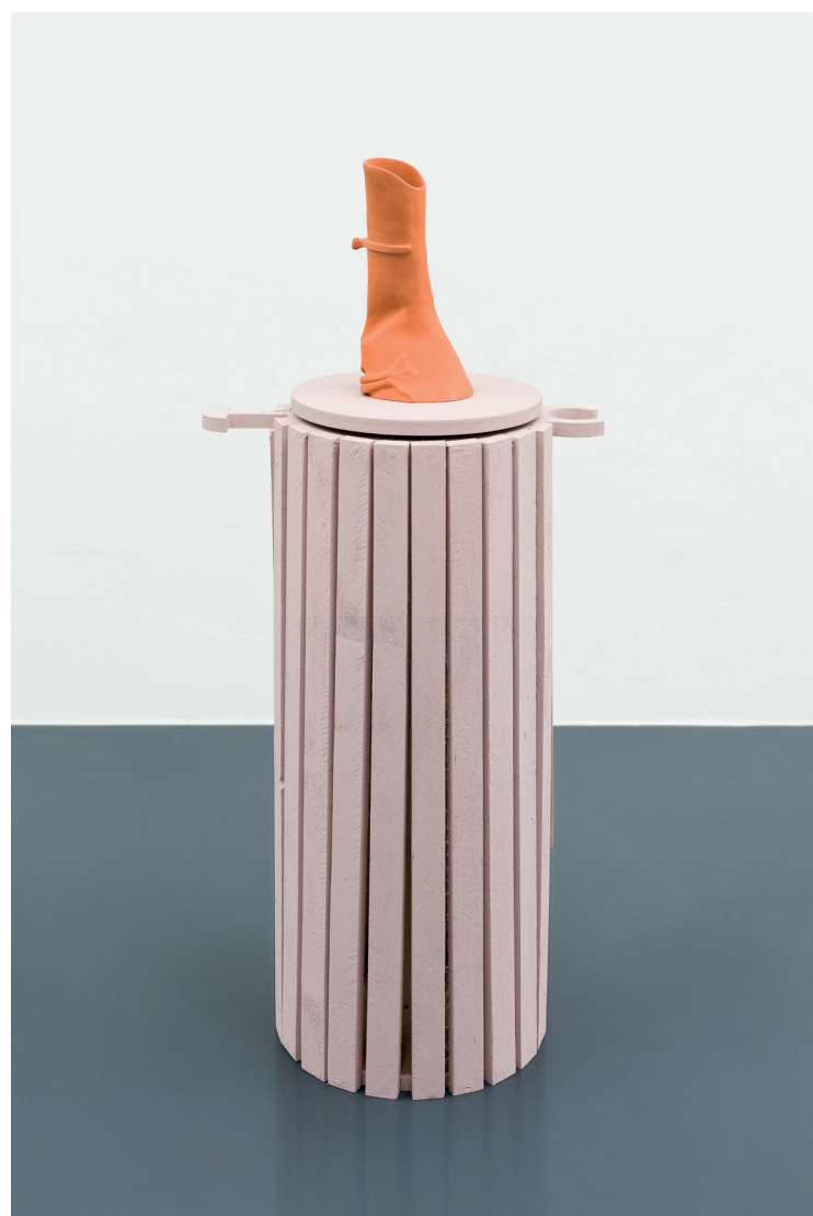
OPPOSITE PAGE 'Heartbreak Highway', 2016, installation views, Real Fine Arts, New York.

The surrealist and mannerist histories in Henke's sculptures suggest a psychological treatment of architecture and space. Yet, if the bodies in this work are the repressed returning, they come back with a gently subversive attitude — for example, in the form of a lone female breast. Soft hills of sculpted-sand breasts were installed around