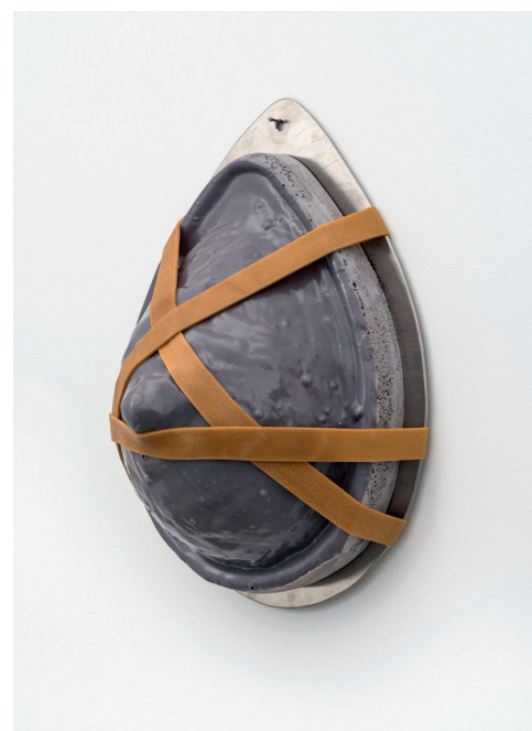
THIS PAGE BELOW Boob (detail) , 2017, sand, resin, steel, dimensions variable.