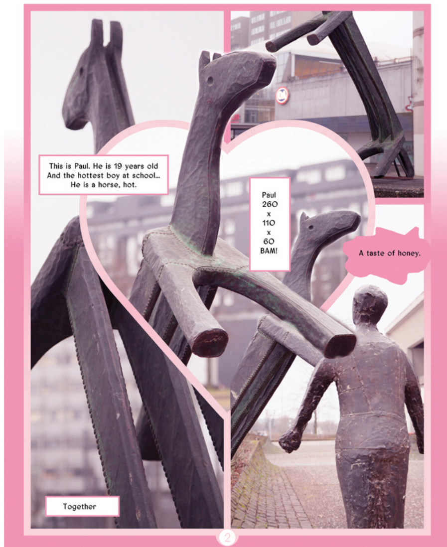
Yes, I'm pregnant, 2014.